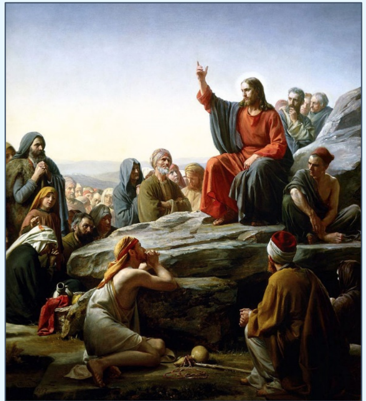
Sermon on the Mount by Carl Bloch (1877), Public Domain

Reference: Foundation Church of New Birth