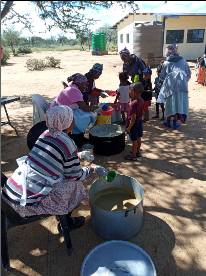
Soup kitchen volunteers serving a meal to children.

The CSNS Board is thrilled with the great progress you and our other donors have helped us achieve this past year! In 2020, with your help, and the generosity of an anonymous donor who matched donations received up to $10,000, we sent $34,000 (Canadian dollars) to our sister charity, Children’s Sanctuary Namibia (CSN).