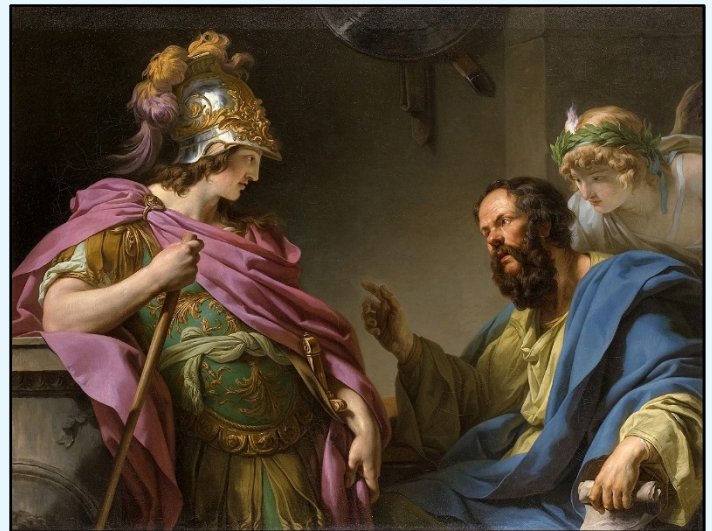
Alcibiades being taught by Socrates, by François-André Vincent

This is why Socrates was a great philosopher and held in such high esteem. We should all use this triple filter each time we hear loose talk about any of our friends, family and other associates. ( https://inspire21.com/stories-friendshipstories-socratestriplefiltertest/ )